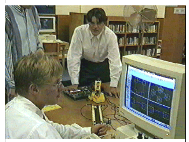
Above: Technology students work on their display in the library.