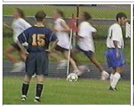
Above: On opening day of the fall sports season, the boys soccer team takes on Rham while cross country runners practice on the track in the background.