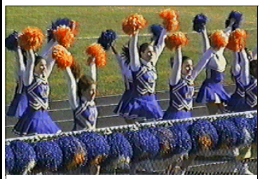
Cheerleaders at a football game.

So far: Indians have lost 3 close games and 1 blowout. Key upcoming games: "All of them....Every game that