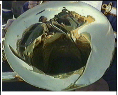
Far left: A band member's horn lies on the ground after falling from the bleachers. Left: Other band members look on. Above: The warped horn after being retreived.