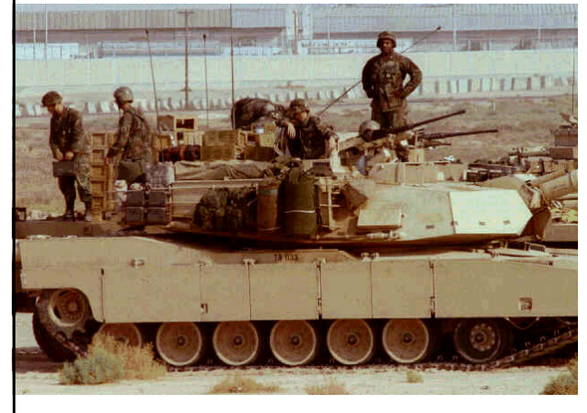
(Continued from page 1)

misread it. Far, far from it. ... I'm not at all prepared to say the crisis is over in any way."