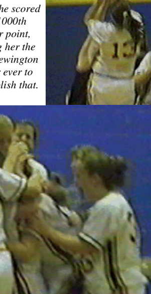
Celebrating Newington's come-from-behind overtime win on Thursday night are players (above) and fans (below).