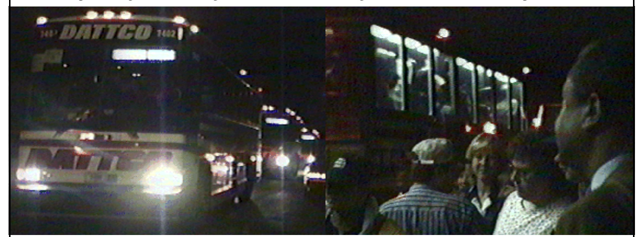
Above: The three Dattco buses that took the Kellogg seventh graders to Williamsburg pull into the school's back parking lot Friday night.

The Wallace trip to Williamsburg was from April 15th through the 19th, the week before April Vacation.